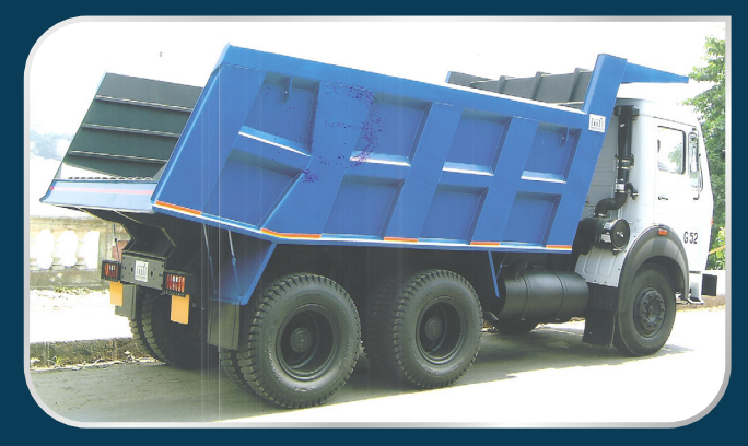
Sandwiched Scow Type Body