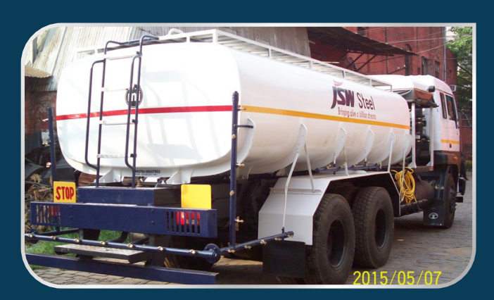
WATER SPRINKLER / Dust Suppression System