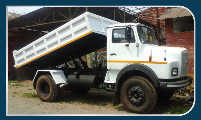
Box Type Tipper Body (under body tipper) without Canopy