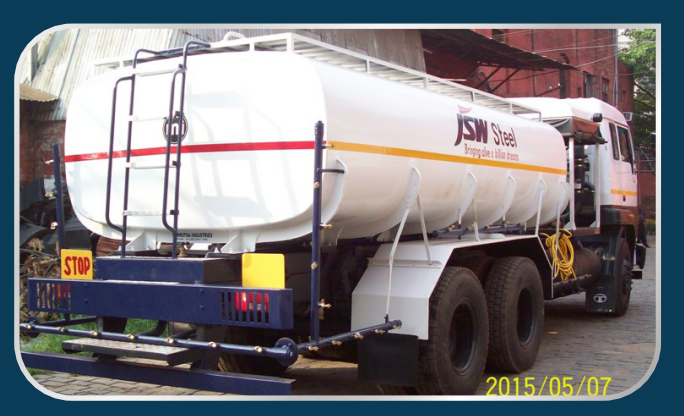
WATER SPRINKLER / Dust Suppression System