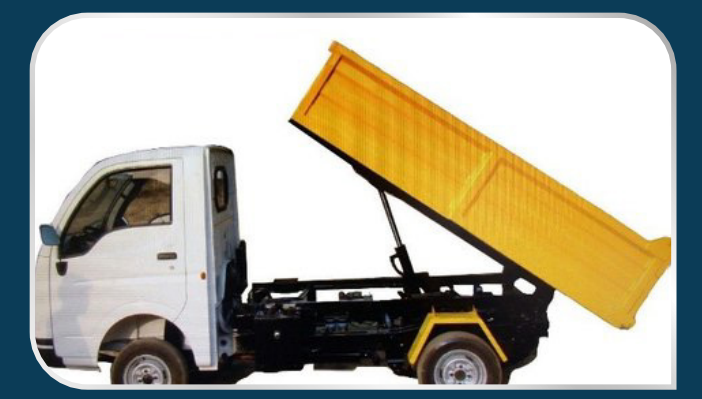
Tipper on TATA Ace Gold (2CuMt. Under Body Tipper)