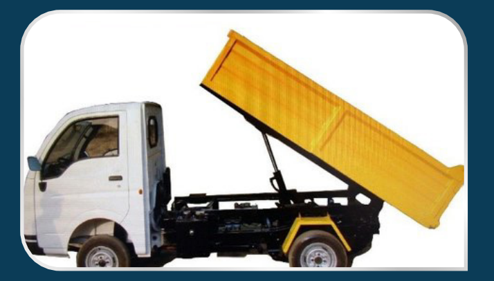
Tipper on TATA Ace Gold (2CuMt. Under Body Tipper)