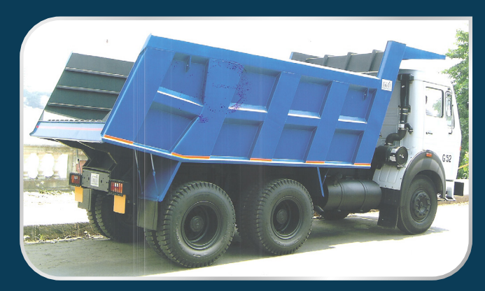
Sandwiched Scow Type Body