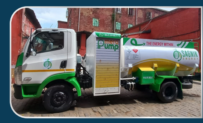
Doorstep Diesel Delivery (3KL,4KL,6KL DIESEL BOWSER )