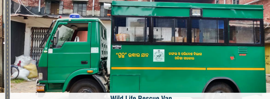
Wild Life Rescue Van