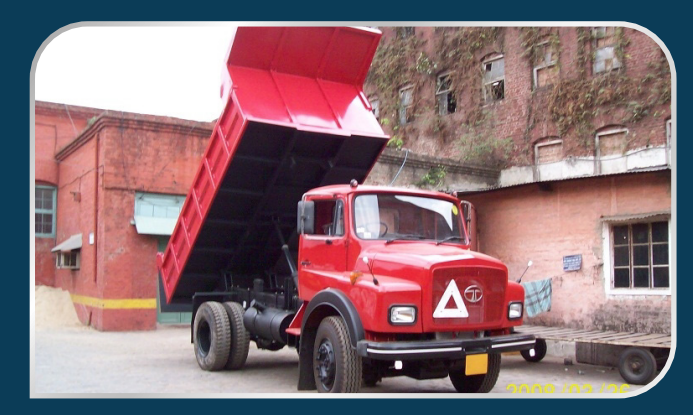
Box Type Tipper Body (under body tipper) with Canopy