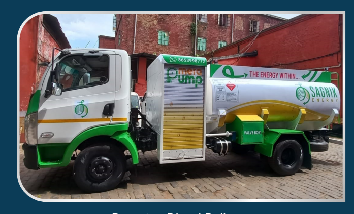
Doorstep Diesel Delivery (3KL,4KL,6KL DIESEL BOWSER )