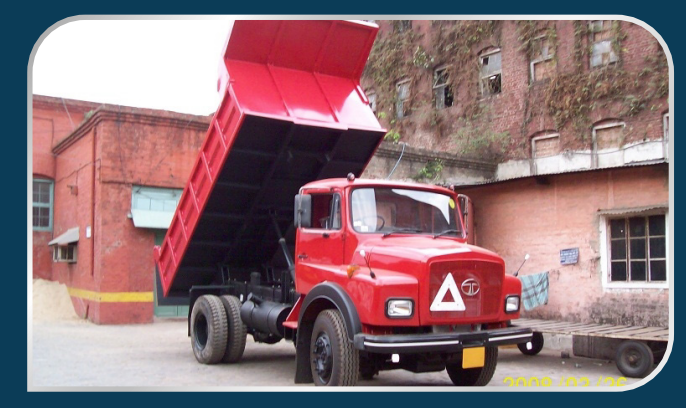
Box Type Tipper Body (under body tipper) with Canopy