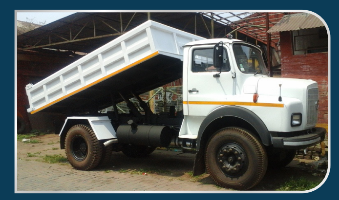
Box Type Tipper Body (under body tipper) without Canopy